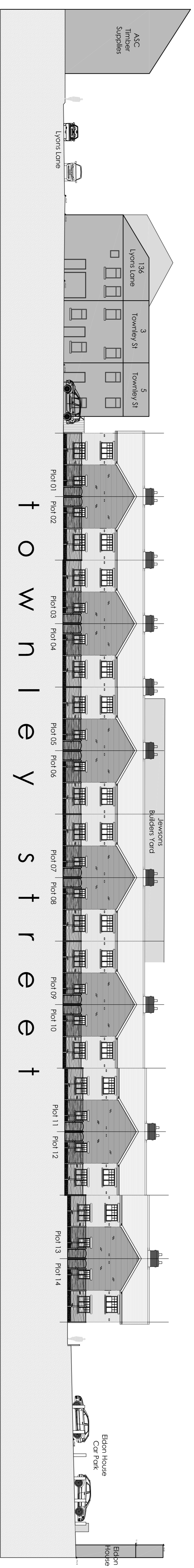
PROPOSED East Site Elevation - Section CC. Scale 1:200 of A1.