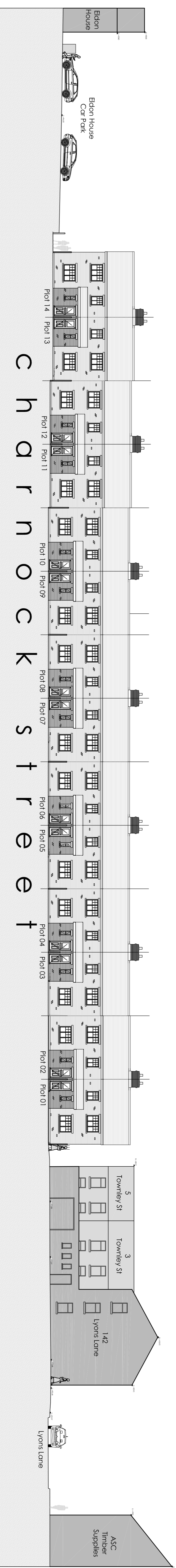
PROPOSED West Site Elevation - Section BB. Scale 1:200 of A1.