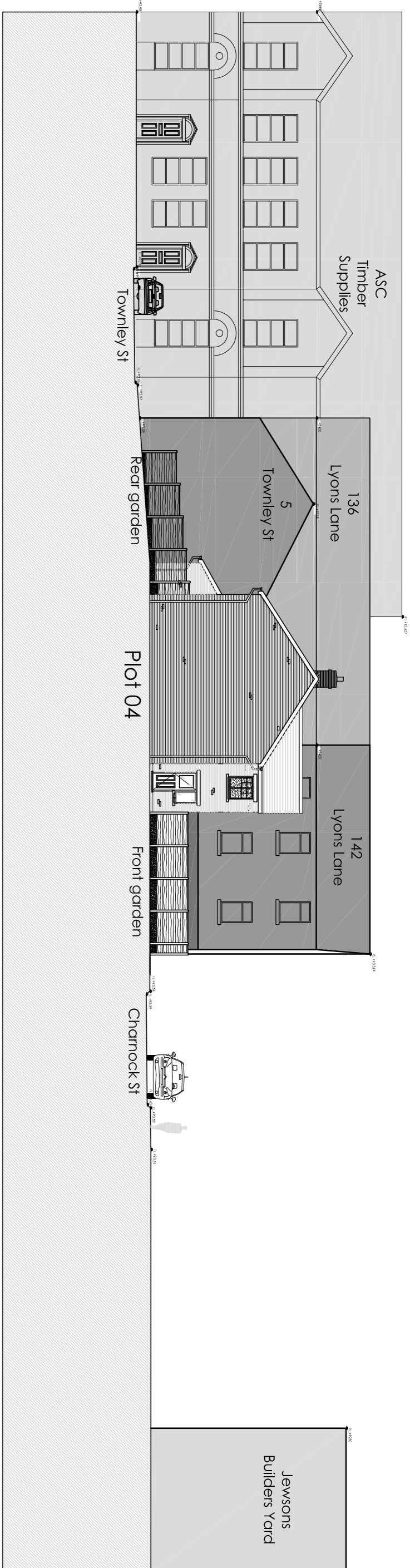
PROPOSED East Site Elevation - Section DD. Scale 1:200 of A1.